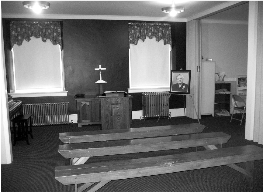
McConnell Chapel, on the lower level of today's Honey Brook United Methodist Church, dedicated in the summer of 2008 -----